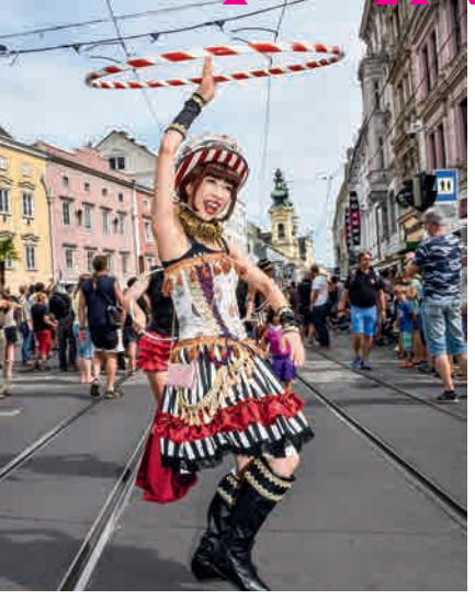
Pflasterspektakel street performance festival