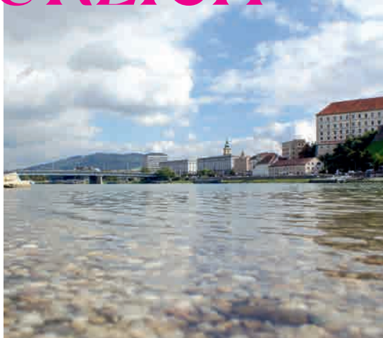
View from Alt-Urfahr toward the city center

The Danube, Pöstlingberg hill, and the city's many parks are integral to Linz and its residents. We have maintained a very natural approach to social interaction as well. The approachable nature of Linzers and a pragmatic, hands-on mentality can be found everywhere in town and represent a positive difference from the culture of many large cities in Europe. Typical Linz, of course.